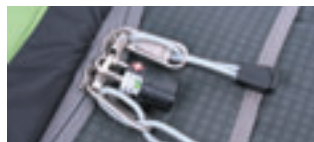
Lockable zips for increased security