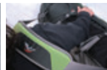
Shoulder strap to provide carry options