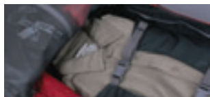
Plenty of internal organisation